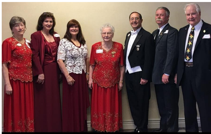
Jump on the Bandwagon Grand Chapter above and Lavender and Lace Outing below