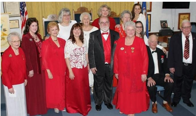
2017 Hay Market Chapter Officers at Installation

- September 26th Faith Chapter #177 we will have dinner before their stated meeting. All you can eat for $10.00 Beef Stroganoff dinner, dessert: Pineapple Up-Side-Down cake, Chocolate Cake and Cookies, etc.