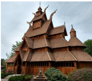
Stave Church at the Scandinavian Heritage Park