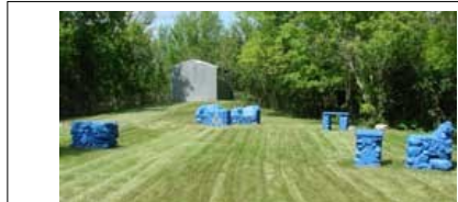
Masonic Island outdoor lodge room

3965 Sky Dancer Way ZNE, Belcourt 701-244-2400